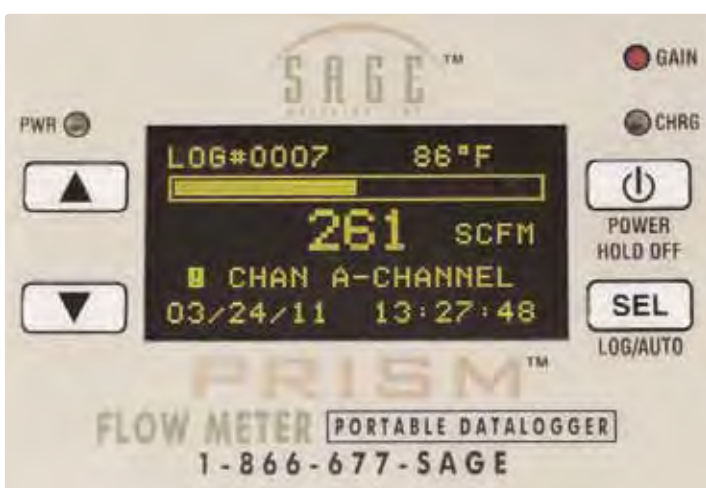
Channel ID Navigation Mode Example 1