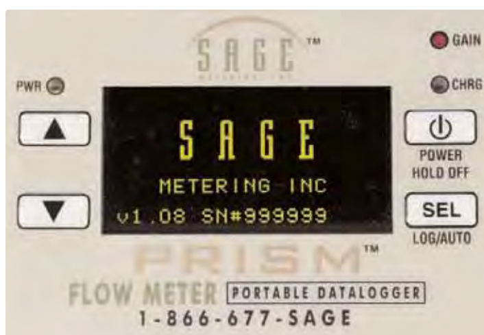
Serial Number Start up Screen