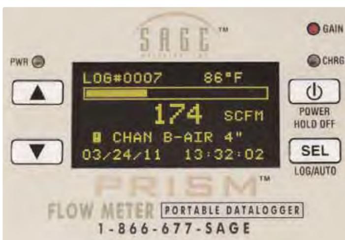
Channel ID Navigation Mode Example 2