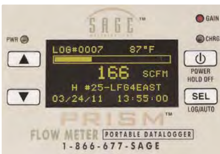
Tag ID Navigation Mode Example 2