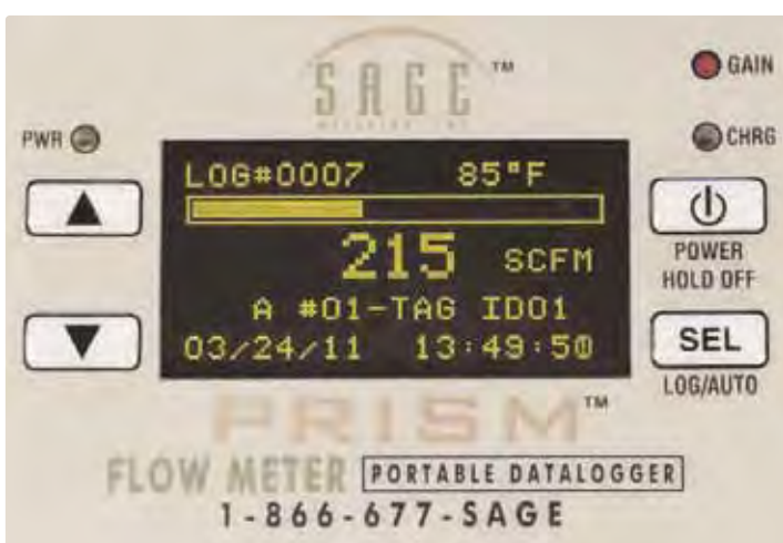
Tag ID Navigation Mode Example 1