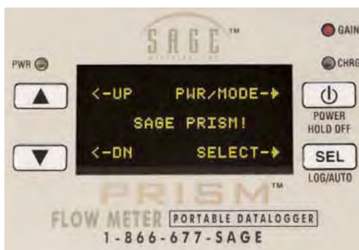
Start up Splash Screen